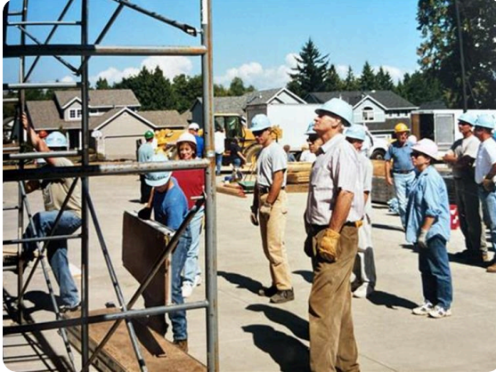
Kingdom Hall Build